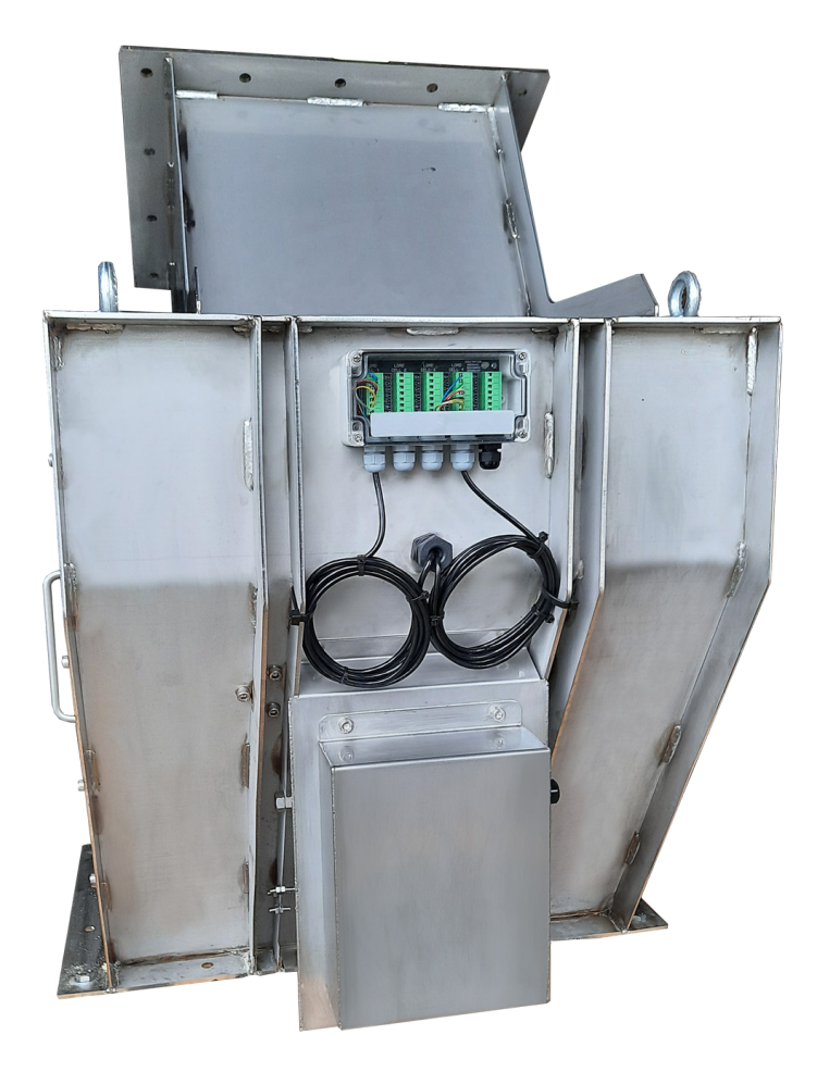
Sasco IW Series Impact Weigher ready for installation at a sugar mill

Sasco's IW Series of Impact Weighers are all highly robust and are of all steel housing construction with a stainless-steel impact plate and mounting, with the option of a full stainless-steel housing.