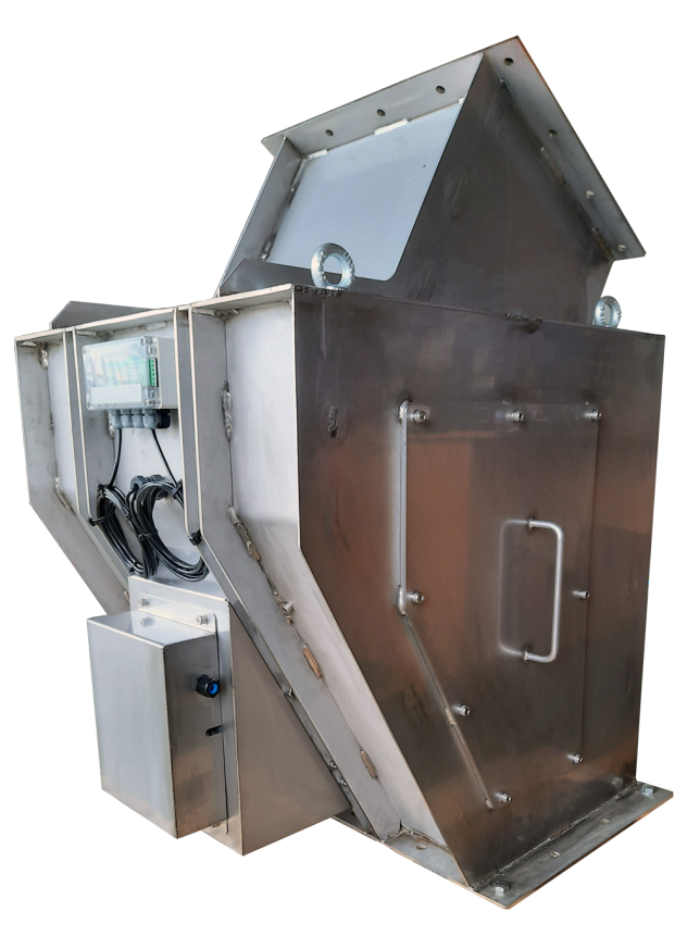
Sasco IW Series Impact Weigher