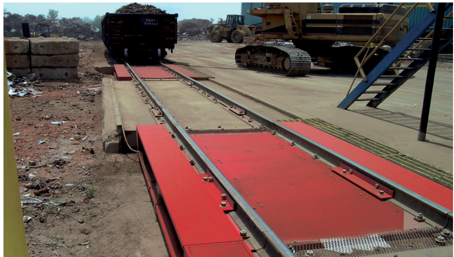
A typical RW-WB installation.

The RW-WB, when installed with Sasco ProRail+ software, provides an array of operational functionality including RFID readers wagon identification, the total integration of weighing data generated with user IT systems and powerful cloud and networking data capabilities, and the use of wagon tare weights for the generation of net cargo weights.