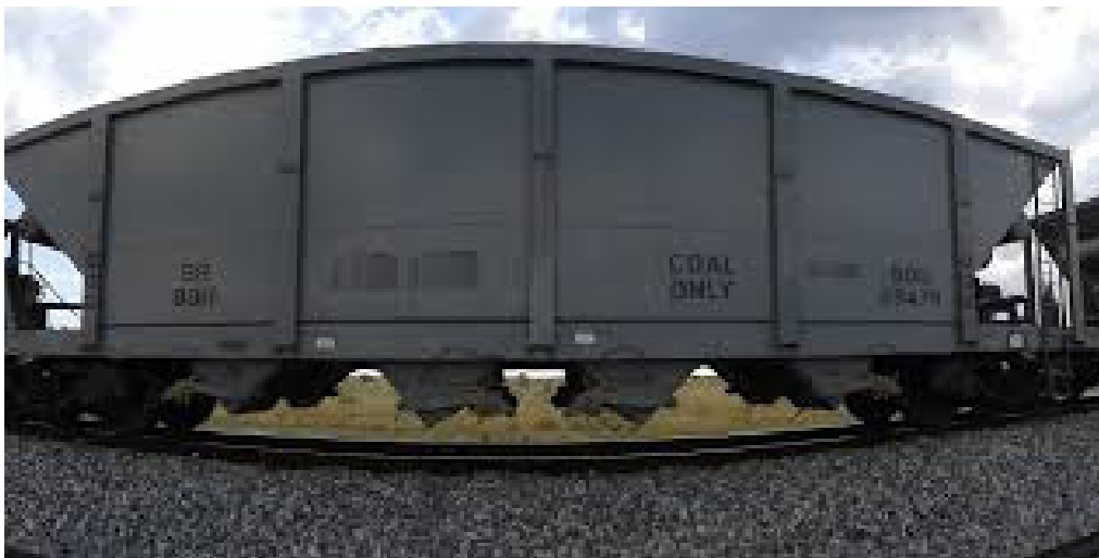
Central discharging coal wagon.

Company D requires a weighing system that will allow for the central discharging of the coal under these weighing procedures.